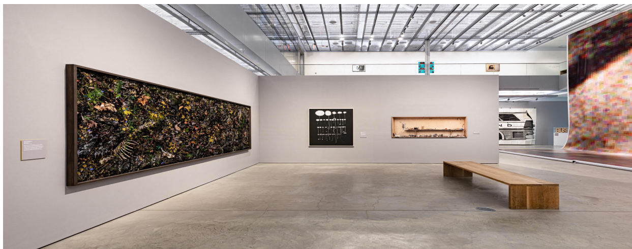
Woven N° 30, 62 x 160" 2018 (installation view at ICP)

Woven No 30 (62 x 160”) by Tanya Marcuse, was featured in Actual Size: Photography at Life Scale curated by David Company at the International Center for Photography (January 28th-May 2nd). She was a panelist in Scale for Meaning , a public program about the show. An extensive interview was published in the Spring edition of Truth in Photography .